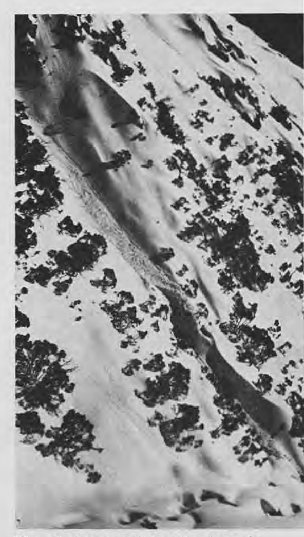
Where the trees grow horizontally—Avalanche Alley joins the Northcote Creek.

Once the timber is reached, by veering left, then to the right through the trees a glade is reached which takes you to a saddle on the spur at 4750 feet. A turn south, and then down again through a lovely slalom gully till you will stop, no doubt breathless, and gaze out at Vic-