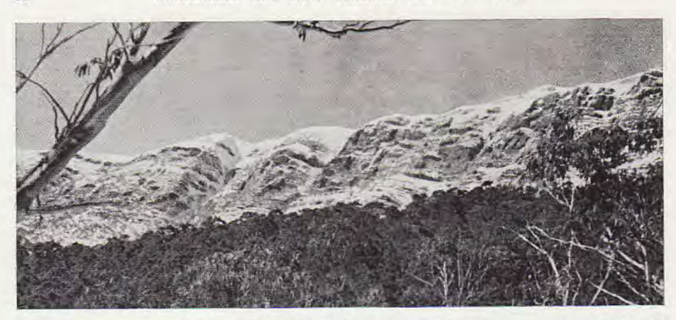
North Wall, the Bluff, from our camp.