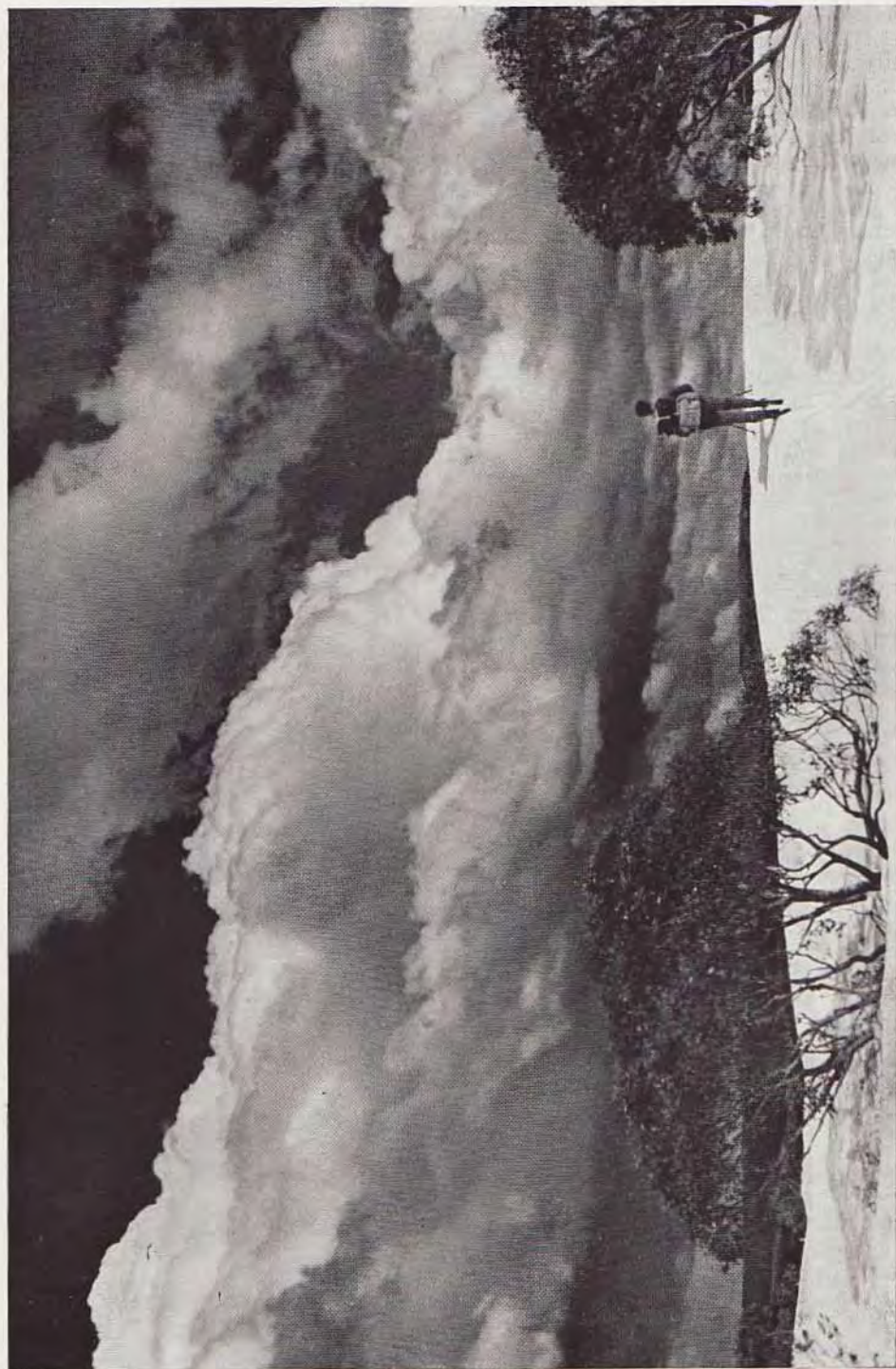
Touring in Victoria.