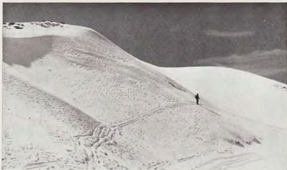
Wind-blown snow, Mt. Smythe, Victoria.