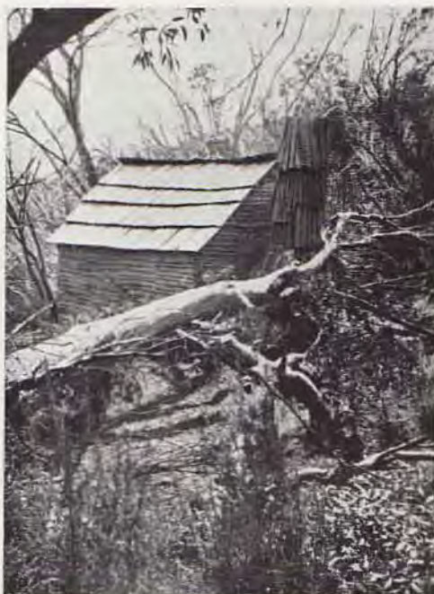
C. J. M. Cole. Bogong Jack's Hut.

F2: Tawonga Hut. Owners, Tawonga Cattlemen, c/o W. Maddison, Tawonga. Location, Bogong High Plain, at the head of Tawonga Creek, a branch of the East Kiewa. Distance from Tawonga, 18 miles; Mount Jim (Flora), 1\frac{1}{2} miles; Cope Hut, 6\frac{1}{2} miles. Altitude, 5,380 feet. Size, 17 x 15 feet. Construction, split palings, iron roof, slab floor. Equipment, shelf bunk for 8 persons, table, camp oven and all necessary utensils. Note: This hut is linked with the main snow-pole system.