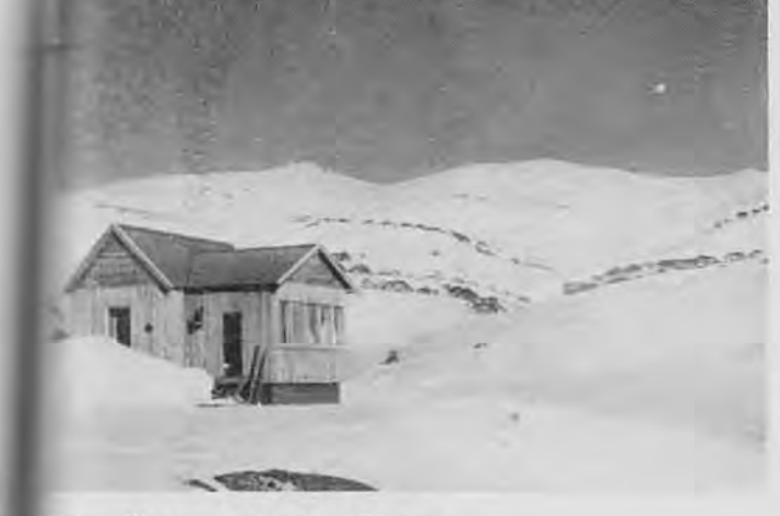
the background.