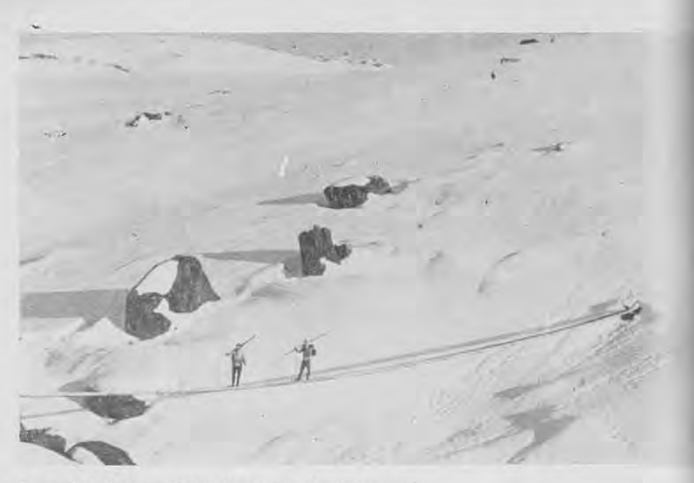
Snowy River Bridge with Mt. Twynam in the background.