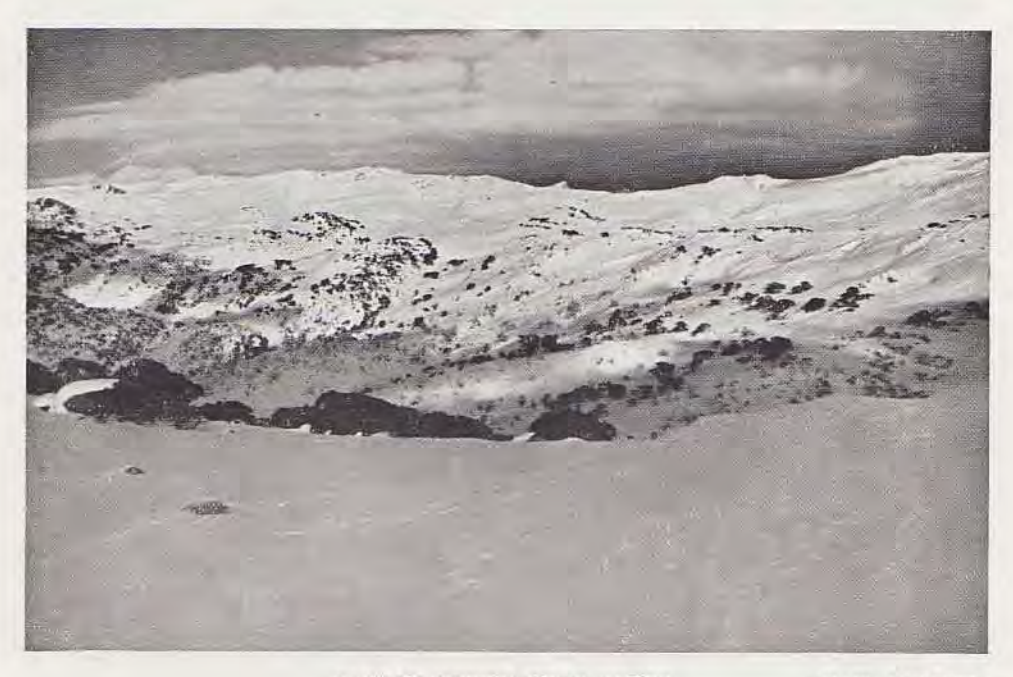
HEAD OF WHITE'S RIVER VALLEY.