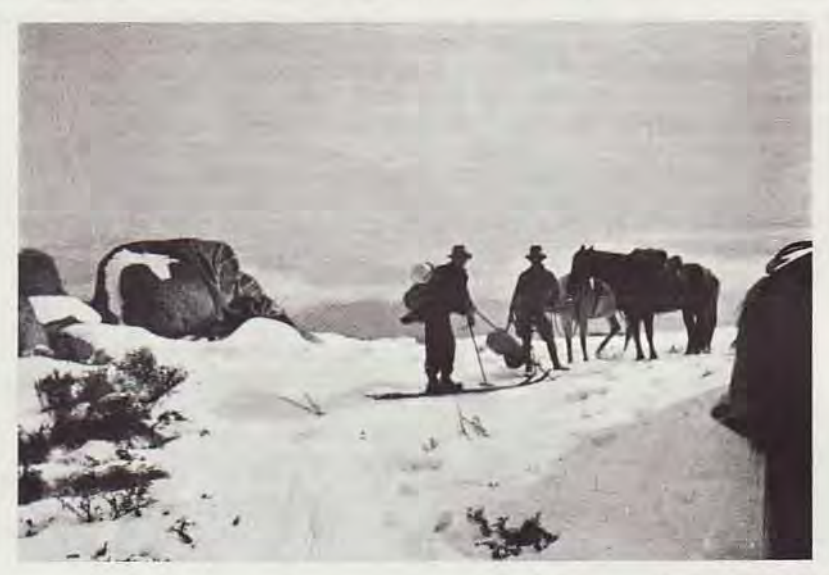
E. K. Mitchell. Leaving the horses at Hammel's Spur.

The three hours ride up the Hammel Spur is a very strenuous one. Once we had left the flats and crossed the river for the last time we had to "ride" all the way, standing in our stirrups and giving the horses every possible aid. The track went straight up, almost perpendicularly, between scrub and tall trees, wet, slippery stones underfoot, soaked earth and, finally, snow. Occasionally the