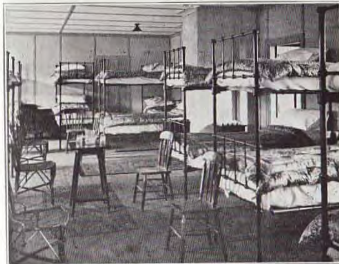
THE MEN'S DORMITORY.