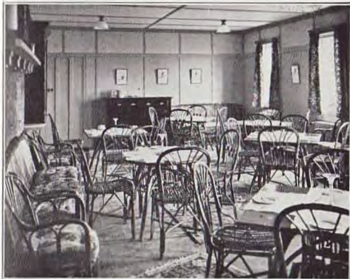
THE COMMON ROOM AT THE CHALET.

The central feature of the chalet is the boiler room, in which is placed two "Ideal" furnaces—one for the hot water radiation service throughout the building, and the other for steam to the laundry and hot water service in the bath-rooms. The water supply pipes are brought in underground and laid into a central pipe duct to the tanks in the ceiling. Around this pipe duct are grouped the boiler room, laundry, lavatories and drying room, and in it are the whole of the pipe services for hot and cold water,